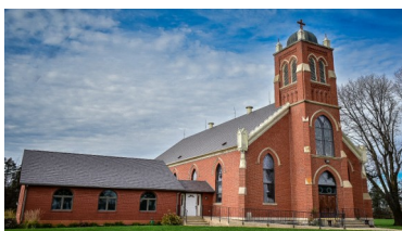
St. Columbkil Church (SC) 36483 County 47 Boulevard Goodhue, MN 55027