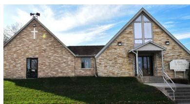
Holy Trinity Church (HT) 211 4th Street North Goodhue, MN 55027