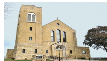
St. Mary Church (SM) 221 Chester Avenue Bellechester, MN 55027