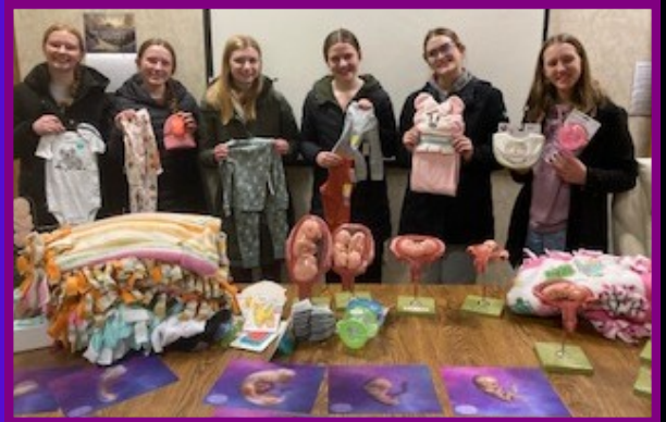
On January 22, the 10-12 grade group bought baby items and delivered them to First Choice Clinic where they learned about the work they do there. They also delivered the blankets made by our sixth graders.