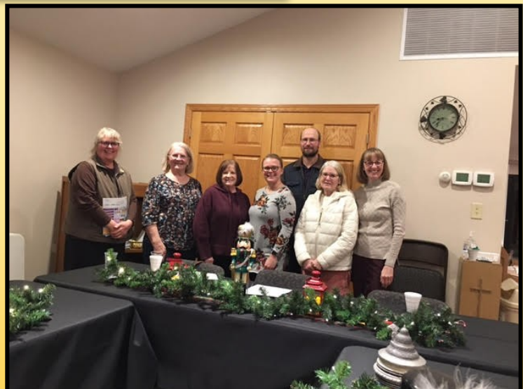
Catechists' Christmas Season Dinner and Mid-Year Review, Thursday, Jan. 2, 2025

Holy Trinity Parish Statistics Liturgical Year 2024: Dec. 3, 2023-Nov. 30, 2024 Baptisms: 11 Received into the Catholic Church: 5 Adults First Communions: 5 Confirmations: 17 Marriages: 2 Anointings: 29 Funerals/Burials: 8 Masses: 396 Communion Services: 23 at Goodhue Senior Living Holy Communion Visits: 149