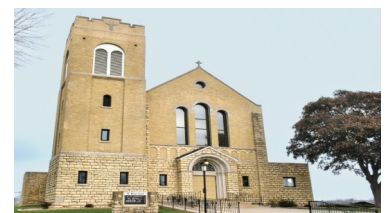
St. Mary Church (SM) 221 Chester Avenue Bellechester, MN 55027