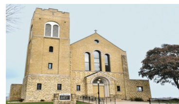
St. Mary Church (SM) 221 Chester Avenue Bellechester, MN 55027