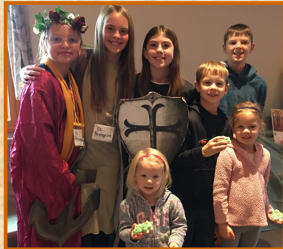
Photo from the 2023 All Saints' Day Celebration

St. Mary CCW expresses thanks for the great turnout for the Fall Bazaar! Thanks to those who helped bake, serve, set-up/clean-up and the many other jobs! Catholic Daughters will distribute Gummi Bears for Habitat for Humanity on Oct. 19-20 We will build the 24th home in Minnesota this year which will be in Red Wing.