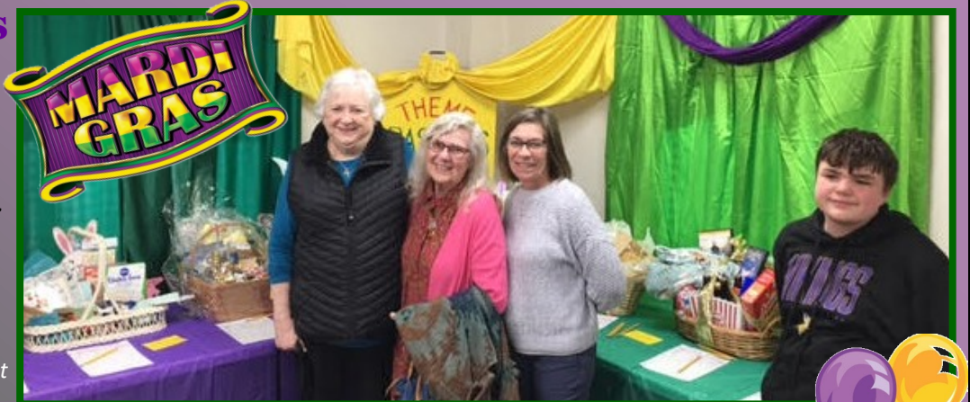
Silent auction theme basket participants and winners at Mardi Gras fundraiser for our parish Youth & Family Ministry and Faith Formation, and 10% going toward First Choice Clinic in Red Wing.