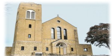
St. Mary Church (SM) 221 Chester Avenue Bellechester, MN 55027