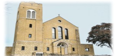
St. Mary Church (SM) 221 Chester Avenue Bellechester, MN 55027