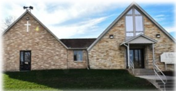
Holy Trinity Church (HT) 211 4th Street North Goodhue, MN 55027