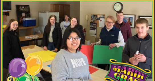
Youth making posters for the 2025 Mardi Gras.

Come and join us on February 23 at the Goodhue Lion's Building for our 2025 Mardi Gras Celebration!