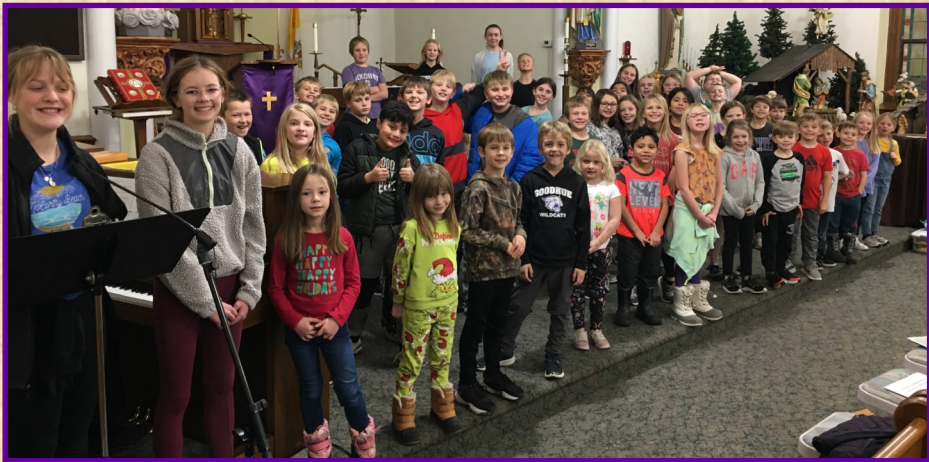
Photo from 2023 Christmas Pageant Rehearsal

Communal Penance Service: All are encouraged to attend this Penance Service with multiple priests, Thur., Dec. 19, 7:30-8:30PM at Holy Trinity. The service begins at 7:30PM and after a short reflection the penitents go to one of the confession areas where one of the priests will hear individual confessions. People can stay for the final prayer as a community if they wish, or leave quietly after they complete their penance. Jesus' first words in the Gospel of Mark, "This is the time of fulfillment. The kingdom of God is at hand. Repent, and believe in the gospel."